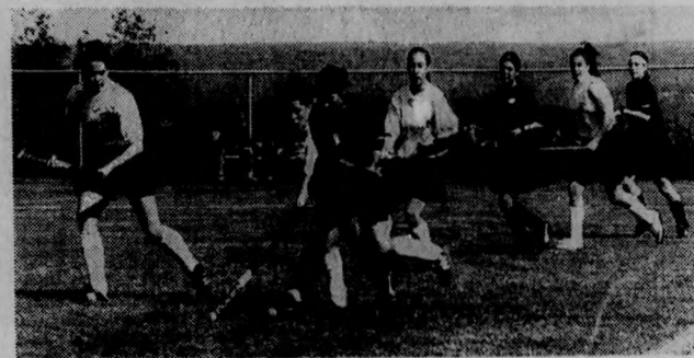
V-Reds stick it to the Huskies.

The Reds will be heading to Charlottetown to take on the UPEI in a double header this weekend.