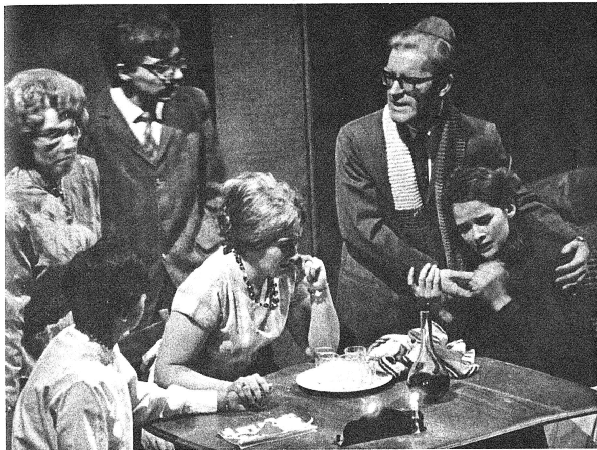
DEAR DIARY —This is a scene from Le Theatre Francais D'Edmonton presentation of Le Journal de Anne Frank. It was held Dec. 17 in SUB theatre, and was a bilingualist's delight. A good time was had by all.