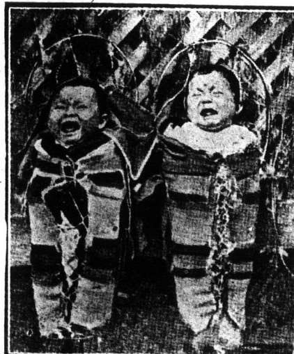
We want the Home Monthly.