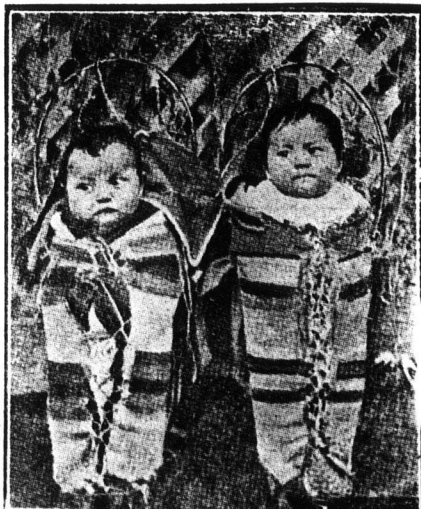
Listening to the Children's Stories.