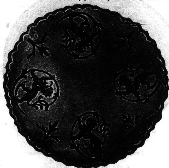
A Red Dragon Design suitable for either Library or Dining Room. L. C. 9117 (28 inch).

Another very handsome centrepiece in the 28-inch size is in l'Art Noveau style with the flowers tinted in shades colored linen. The pink flowers are worked on the edges in heavily padded satin stitch, outlined on the inner edge with black. The leaves of the pink flowers are worked in long and short stitch with green. The blue flowers are couched on the edges with blue, outlined on the inner edge with black, and the dots in all the flowers