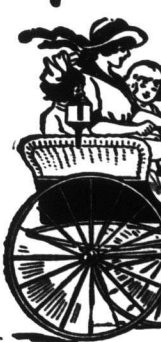
FOURTH PRIZE Lovely Shetland Pony. Value $100.00