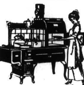
FIFTH PRIZE Clare Bros. Famous High Oven Range. Value $75.00