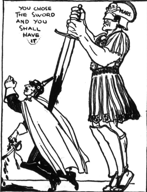
PROVERB PICTURE No. 1

NOTE THIS AND SEND YOUR ENTRY IN TO-DAY. THIS IS THE OPPORTUNITY OF A LIFETIME. You can win the auto or your share of the big prizes if you try. According to the rules, contestants may send as many as three answers to each picture, if they desire, as if you are in doubt as to the correct proverb to fit Picture No. 1, you may send two extra solutions. Send your answer to WAR PROVERB EDITOR, CONTINENTAL PUBLISHING CO., LTD.