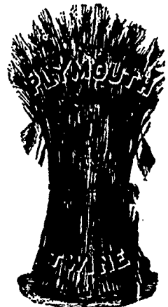
Trade Mark - Registered

JOHN L. CASSIDY & COMPANY, —IMPORTERS OF— China, Crockery and Glassware,