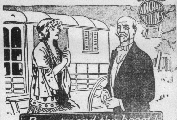
Beauty and the beast