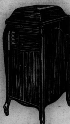
Victor-Victrola XI, $ Mahogany or oak

The earnest men are so few in the world that their very earnestness becomes the badge of nobility.