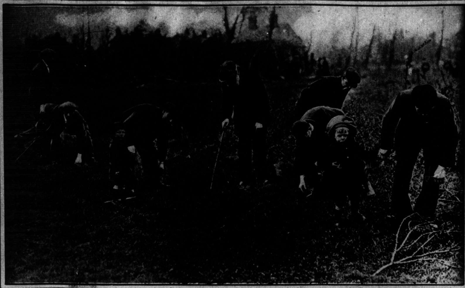
Residents at Wallsend, England, looking in the fields for souvenirs after the latest Zeppelin raid over the north east coast.