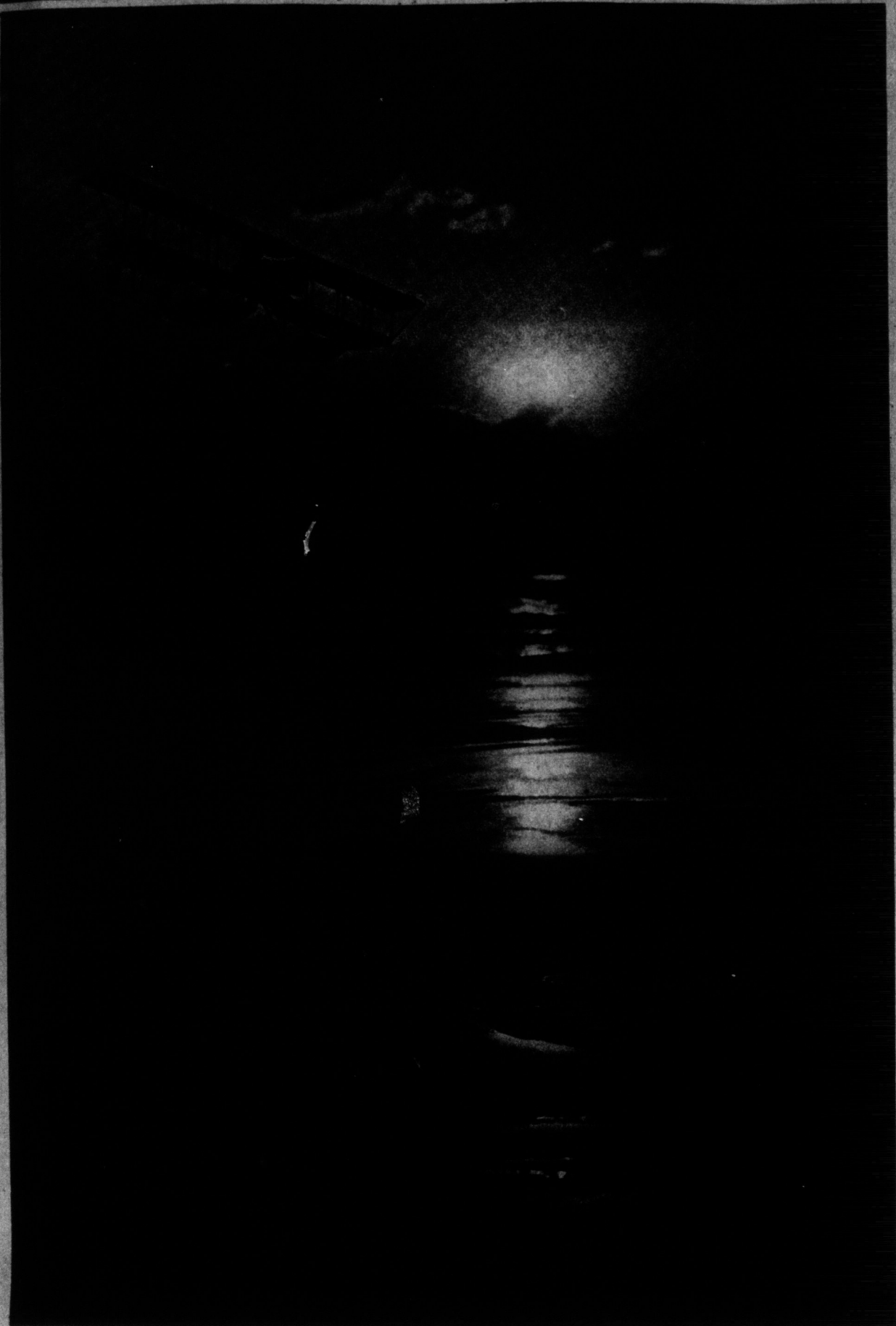
Reading "the riddle of the sands"—A hydroplane making a night reconnaissance of a coast line at low water—An exquisite picture of the new romance of the air which aviation has called into being.