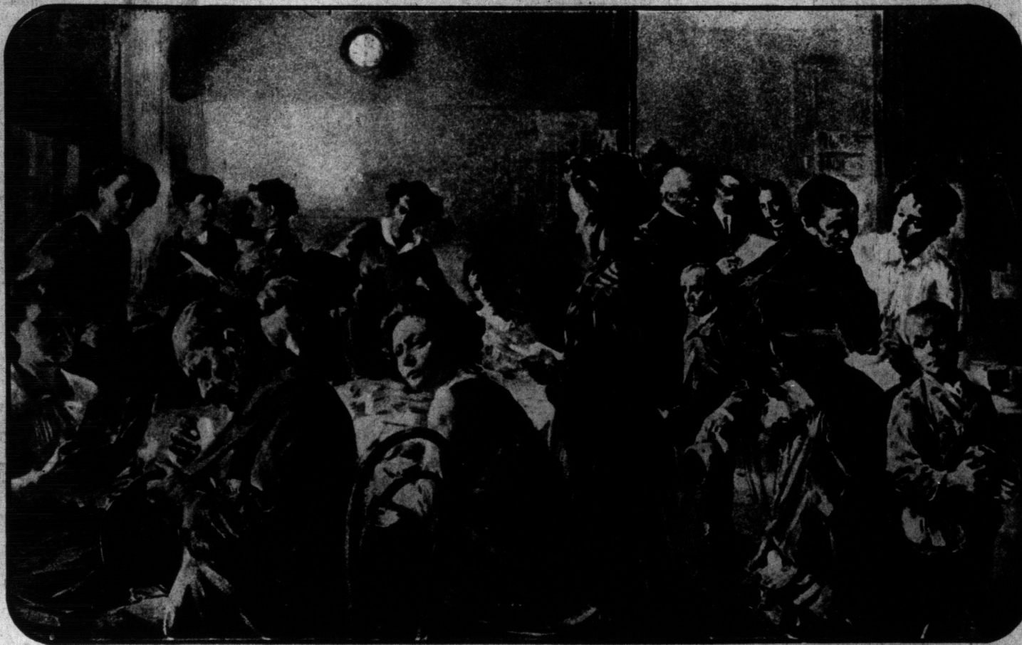
Seeking news of the missing—Relatives of Germans in the field at the "casualty" information bureau, Leipzig.