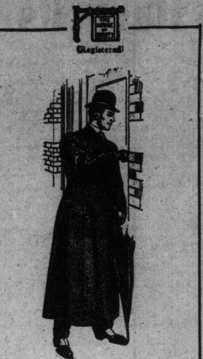
T. P. O'CONNOR, M. P.

East Toronto. East Toronto, Oct. 7.—The Athletic Club will hold an adjourned meeting in the Y.M.C.A. hall to-morrow night when a number of important matters will be brought forward.