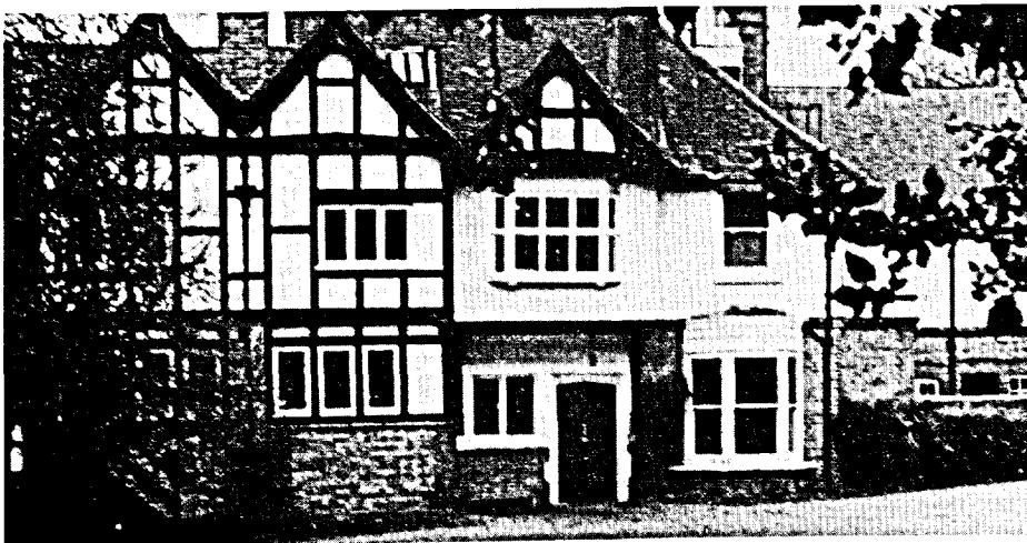
Canadian School in Woking, Surrey, south-west of London, England.