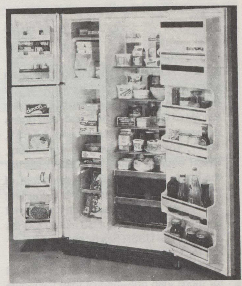
Inglis will be one of the Canadian firms displaying major kitchen appliances.

Limited – major appliances including ranges, dishwashers and freezers;