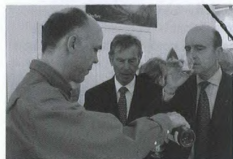
Alain Juppé, Mayor of Bordeaux and former Prime Minister of France, tasting the unique Neige ice cider being served by François Pouliot (left).

In the last six months, Neige has been impressing audiences at events all