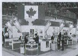
FOODEX 2003 (See p. 2)