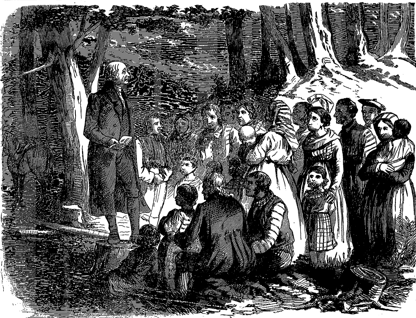
PREACHING AND BAPTISING IN THE FOREST; SITE OF THE TOWN OF GALT 1822

[$3 PER ANNUM IN ADVANCE. SINGLE COPIES 7 CENTS.]