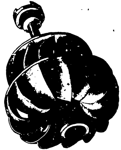
Cut Showing Wheel Removed from Case.

Made in sizes from 6 inches to 84 inches diameter. Wheel One Solid Casting. 84 per cent of power guaranteed In Five Pieces. Includes whole of case, either register or cylinder gate.