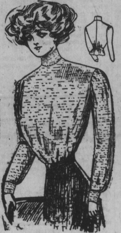
A PLAIN FITTING BLOUSE.

A favorite model in lingerie is the princess corset cover and drawers combination. This is made of fine batiste or linen and trimmed with long lines of valenciennes lace and hand