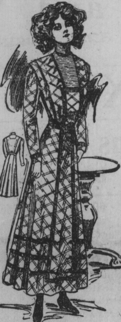
A PRETTY PLAID GOWN.

Serge will hold its own as a costume fabric, and the inevitable navy blue