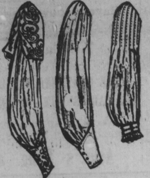
SOME NEW SLEEVE DESIGNS.

Sleeves in bishop style are among the latest to appear. Here are three