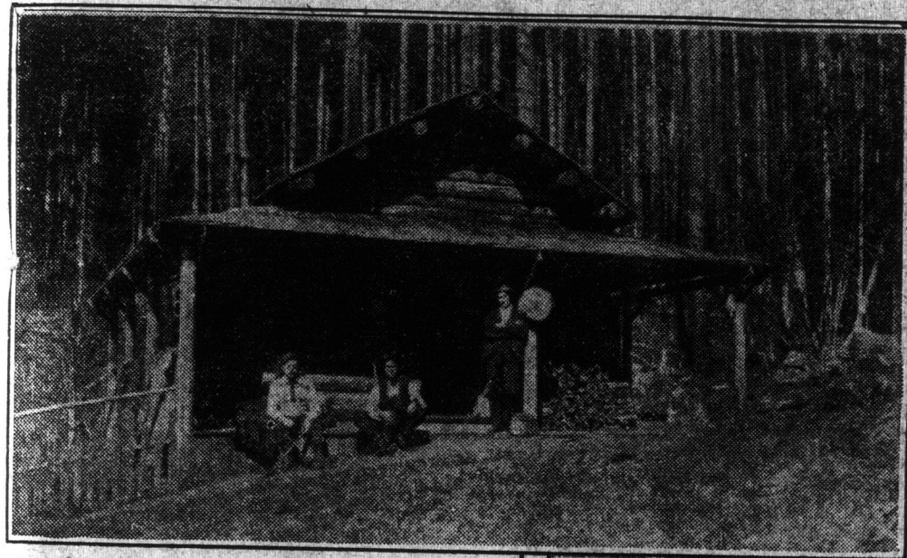
A Western Shooting Lodge