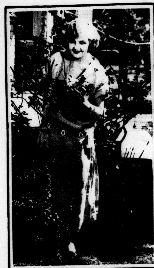
Eileen Sedwick, Universal screen star