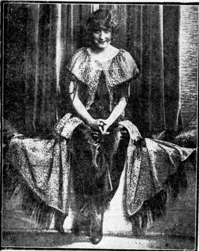
A summer afternoon gown in a unique design of white lace over black Molly O crepe. The lace is adorned with black monkey fur.