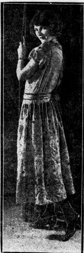
A sub-deb frock of charming simplicity in golden brown indestructible chiffon voile. The sleeves are demurely puffed.