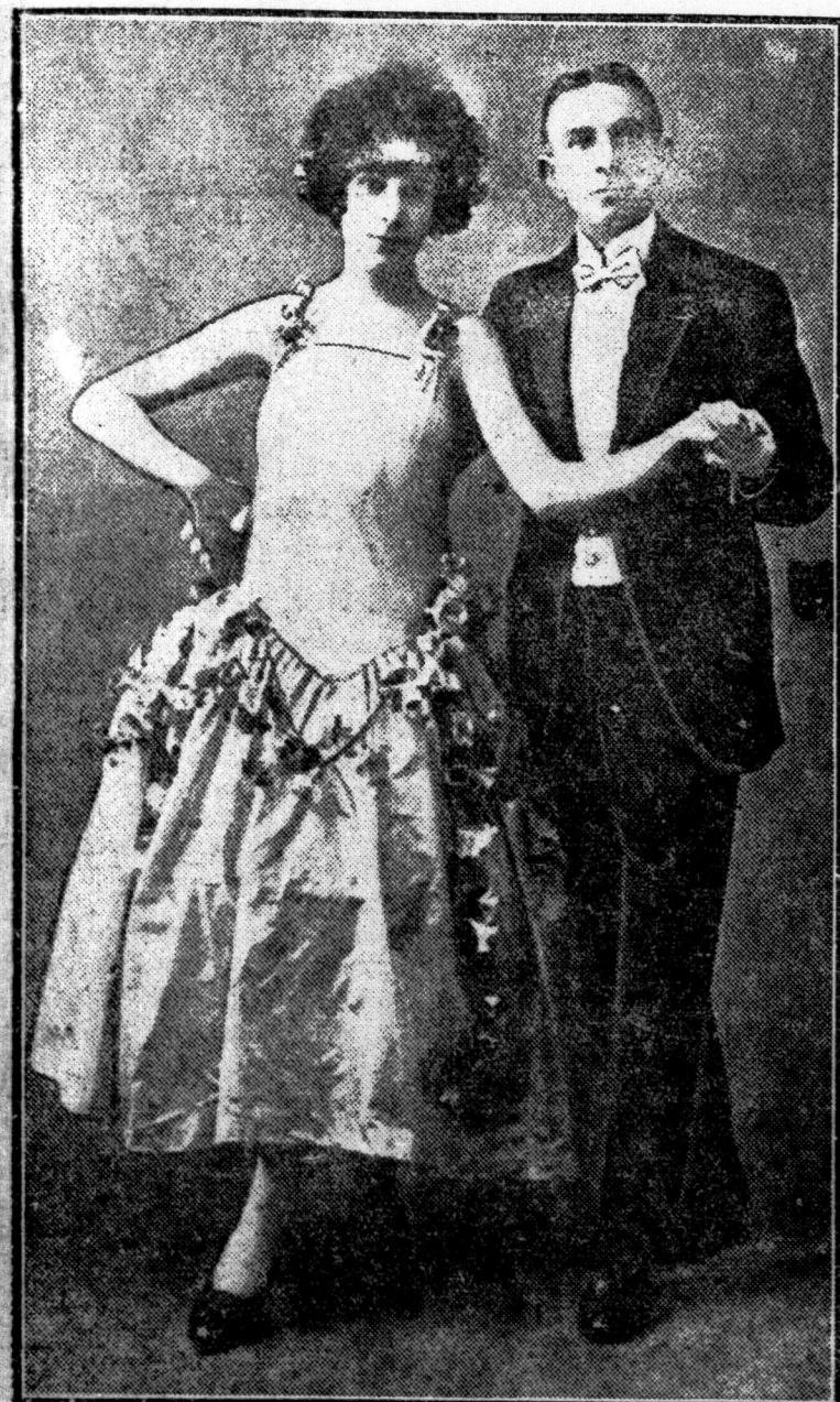
French dancing masters have introduced a new dance which they say is both very much up-to-date and very correct. They have named it "La Liserette."