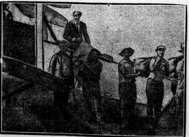
Lost in the Florida everglades for nine days, a party of 26 motorists suffered untold hardships from hunger and exposure. They were finally discovered by this rescue plane. A photographer walked 30 miles through swamps up to his waist to get this picture.