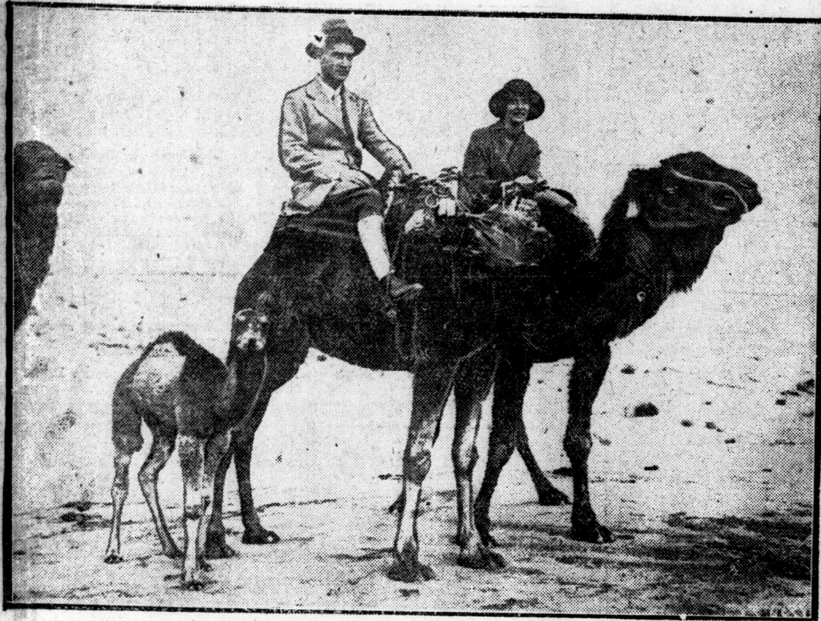
Algeria is now becoming a famous resort, thanks to the recent archeological discoveries there. Camel owners, as a result, are reaping a harvest from tourists. The baby camel shown in this photo is one month old and walked thirty miles the day after it was born.