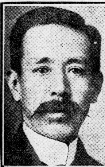
President Kasuya, who was a short time ago elected president of the Japanese House of Peers.