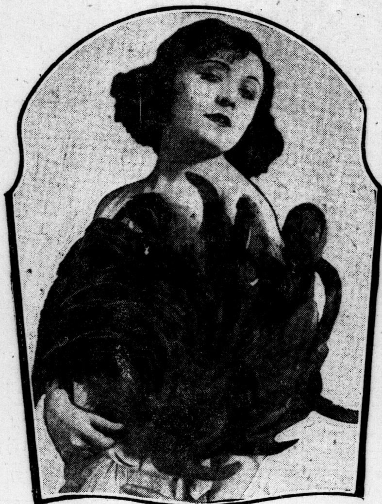
"She is the only one who could hold him," said Charlie Chaplin's first wife when asked what she thought of his engagement to Pola Negri. A glance at this photo of Pola would seem to substantiate this statement.