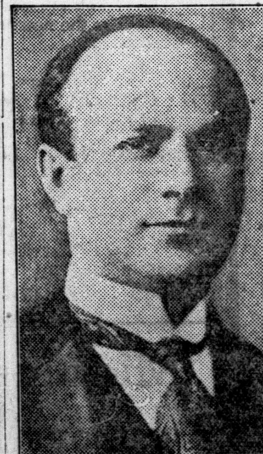
MISCHA ELMAN, famous violinist, who will appear in concert in London on the evening of January 3.

SEE STREET PARADE AT NOON EACH DAY WORLD'S GREATEST MINSTRELS COMEDIANS SINGERS DANCERS AND JUST LOOK AT THESE BARGAIN PRICES! Ev'gs 25c, 50c, 75c, $1. Mat. 25c, 50c, 75c SEAT SALE OPENS MONDAY, 9 A.M.—SECURE THEM EARLY.