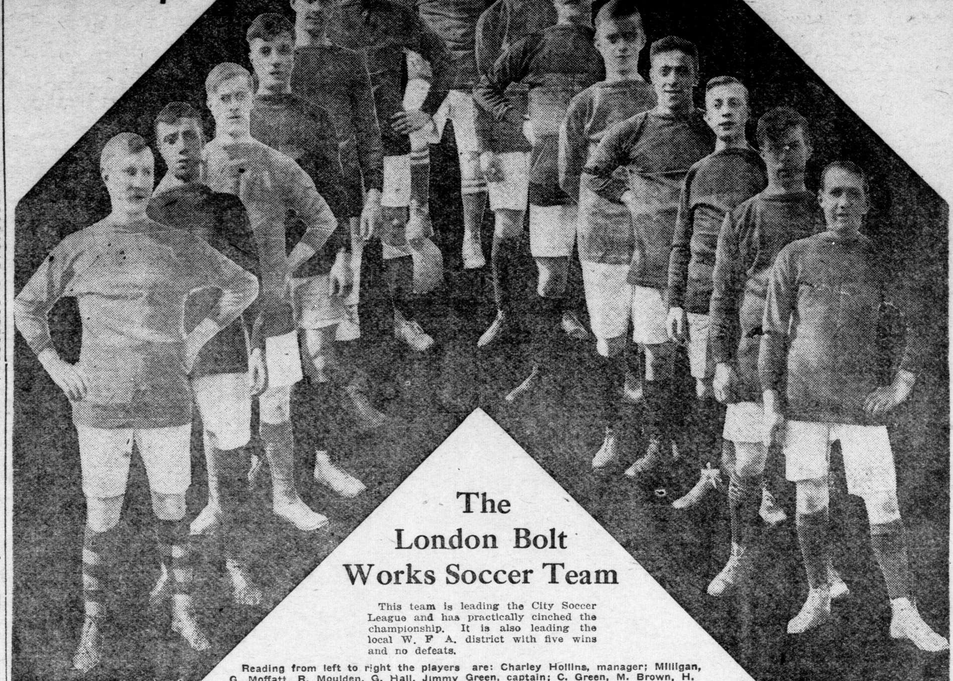
The London Bolt Works Soccer Team

The Semi-ready Store, 182 Dundas Street.