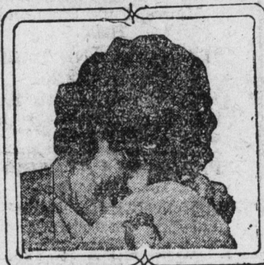
BEAUTY IN YOUR CARRIAGE.

A woman's carriage has much to do with the position of her shoulders. If the chest is held out and the chin and abdomen held in, the shoulders will take care of themselves. The back also will be naturally straight. It is said that if a person is standing correctly the shoulder blades will not protrude and cannot be felt by another if the hand is passed over the first person's back.