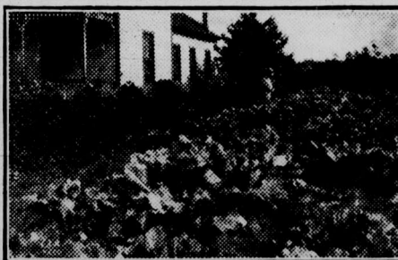
Beautiful Home and Garden at Freeport.

C. S. Judson Co. Limited 181 Market St., Winnipeg