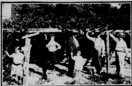
Single Scupperong Grape Vine at Freeport.