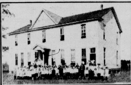
Freeport School and part of Pupils.

NOTE:—No part of the land described in this advertisement is more than 4 miles from Freeport. Some of the land almost touches Freeport.