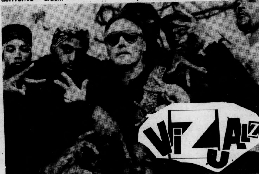
'Whoa! Hold on kids, I've just had those dry-cleaned!' - Rentasuzzbag extraordinaire meets up with his Los Angeles Fan-Club in the recent film release 'Colors'.

It calls for two-man teams to patrol the streets in unmarked cars in uniform. As one high-ranking officer explain, "They fly their colors. We'll fly ours."