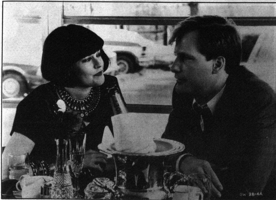
Something Wild: cool soundtrack; so-so soundtrack album