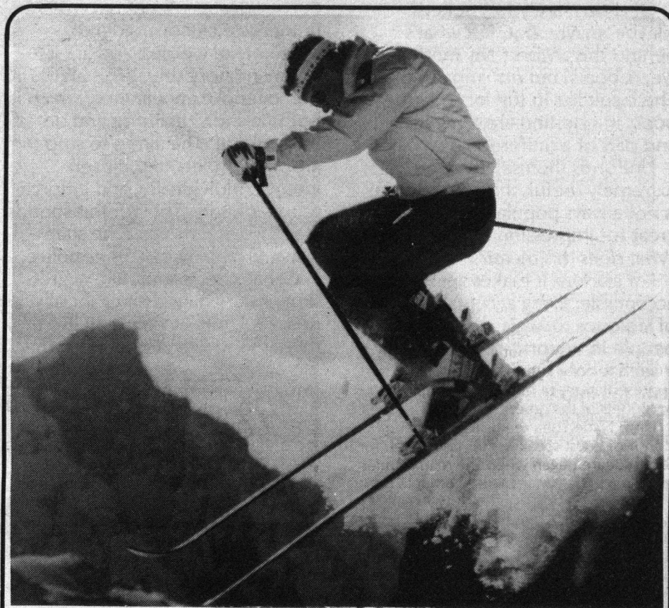
"Beyond the Edge", Warren Miller's 37th feature film, will be shown this Sunday at 8 p.m. in SUB Theatre.

The only really disappointing thing about this album is that some of the excellent instrumentals that punctuated the movie are missing. But when you pick ten songs out of forty something has got to go. Alas.