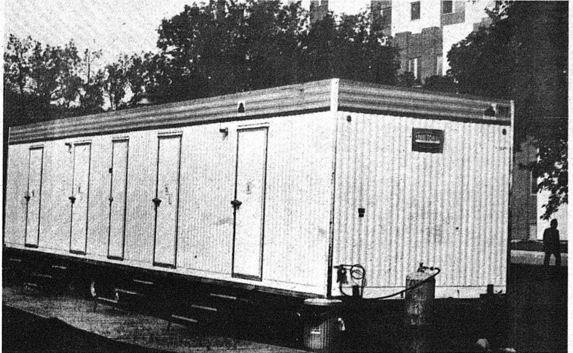
One of the Arts Court housing trailers erected in the Arts Court.

The Registry itself is in operation until September 30, although the temporary trailer units are only available till the 15 of the month. Hopefully the remainder of the student body still without permanent housing will be settled before the Registry closes down for the year. LaPerriere feels that a