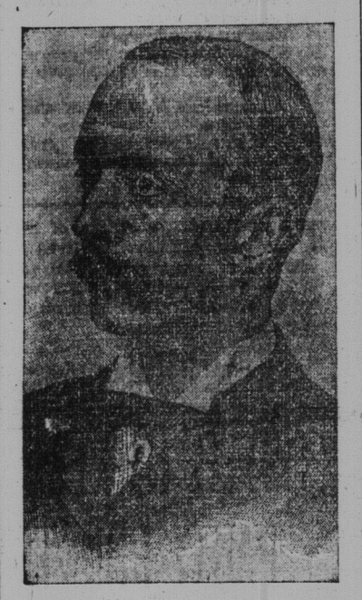
EARL GREY, GOVERNOR-GENERAL

London, Jan. 12--Premier Balfour, speaking at a banquet given in his honor at Glasgow tonight, avoided the fiscal question except to say that he had nothing to add or to retract from his Edinburgh speech. He hoped conferences with the colonies soon would be quite as essentially a working part of the empire as the house of commons.