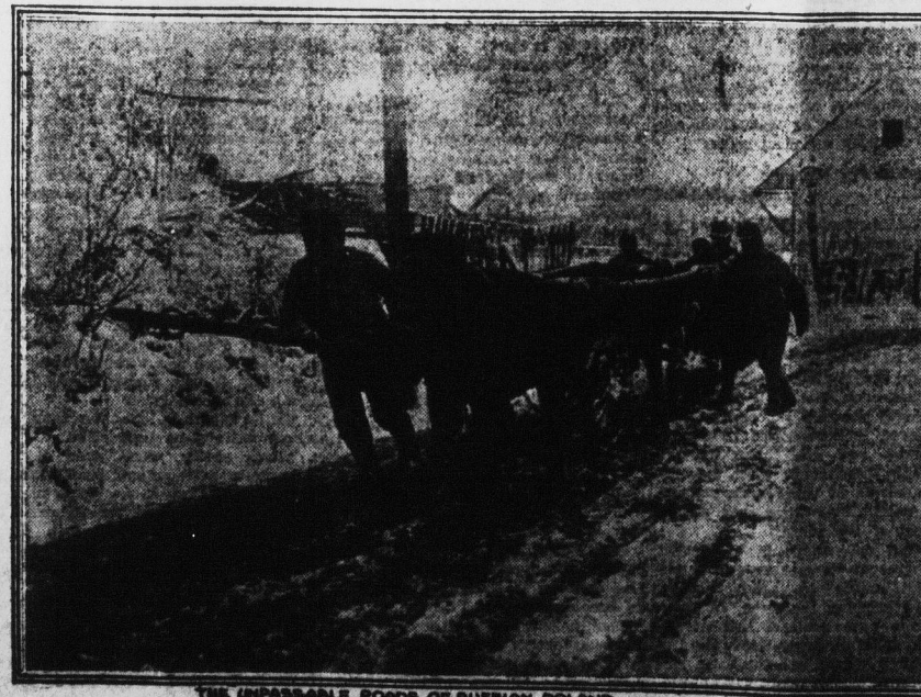
may readily be seen by the efforts of the soldiery pushing this s