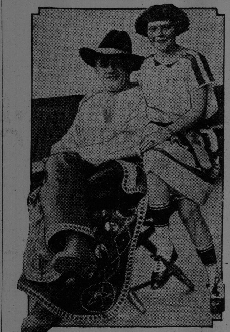
It's a far cry from busting noses to busting broncs. Johnny Kilbane used to be a nose buster. For years he was featherweight champion of the world. Then a little Frenchman, Eugene Criqui, came along and knocked him off. Kilbane hung up the gloves and quit for good. Last summer he spent his time in the west busting broncs on a Montana ranch. You see him pictured here with his little daughter.

of a shortstop. The Yanks also need reserve strength and a better assistant catcher to Wally Schang than Fred Hoffman. Schang has seen a lot of service and he is getting brittle. It seems strange to be figuring that the Yankees need another pitcher after their "all-star" regime of three years, but their pitchers are mostly aging veterans and they cracked this season. The Yanks are fairly well fixed in the outfield with Meusel, With, Ruth and Combs, but they have no sub for Ward or Dugan but McNally, and he is not strong enough or good enough to last through a season. Lou Gehring is a good pitcher for Wally Pipp and a fine pinch-hitter.