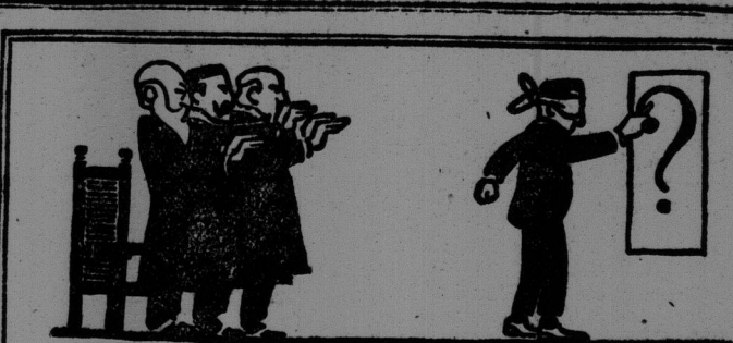
Three hypnotists put a man in a trance and asked him to write the 7th point—he did.