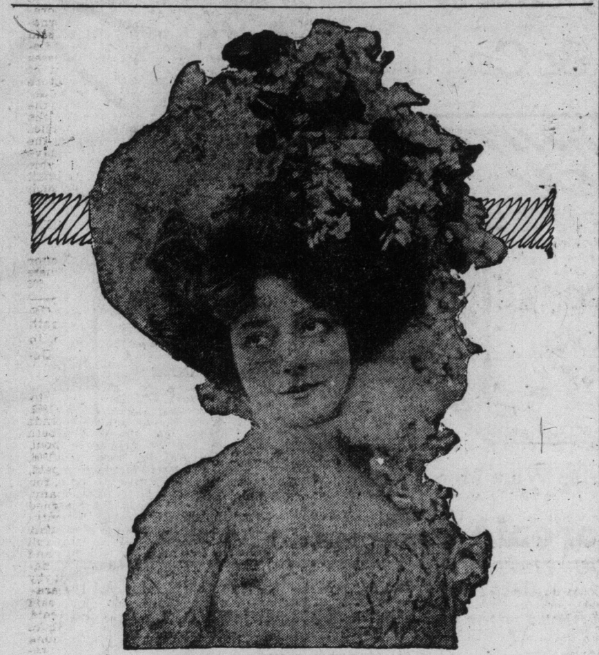
ANNA HELD At the Princess Next Week.