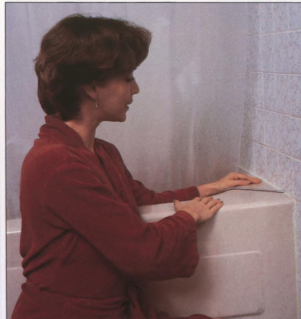
Drip Strip is a 'must' to prevent damage from bathtub drips and overflows.

DRIP-STRIP™ is easy to install, fits any bathtub contour and is available in a choice of decorator colours to match the bathroom decor. DRIP-STRIP™ can also be used on sinks and shower stalls.