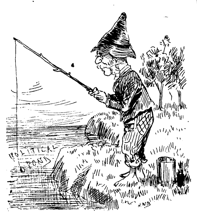
THE LONE FISHERMAN;