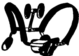
ABDOMINAL AND SPINAL SHOULDER AND LUNG BRACE.