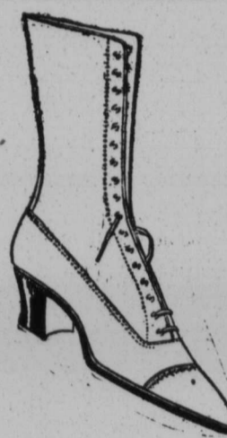
Far-a-Head Boots for Women, style No. 917