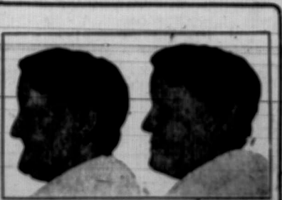
THE WRONG and THE RIGHT

Some time ago we sent a letter to several Guide readers asking them for suggestions as to how we could improve The Guide. One was of the opinion that the best thing to do would be to drop out all the advertisements. Perhaps there are some who do not realize the important part that advertising plays in making a farm paper a going concern.