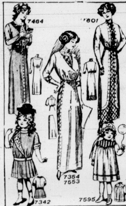
ATTRACTIVE GARMENTS FOR ALL OCCASIONS

NOTE—Ten days to two weeks must be allowed for the forwarding of patterns.