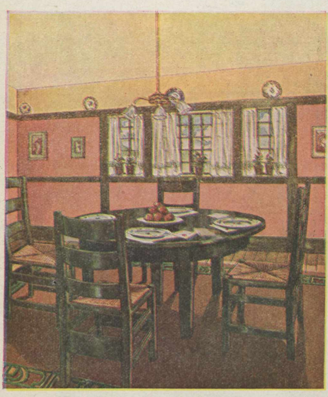
As shown in our book, "Homes Healthful and Beautiful," DINING ROOM