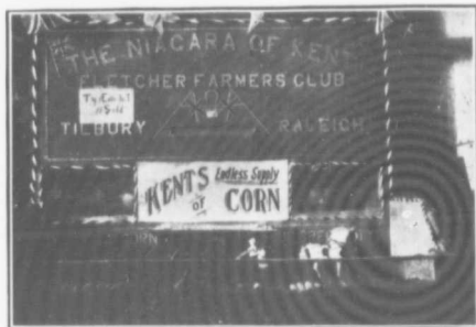
Tilbury East Exhibit at Corn Show.

Transportation facilities are excellent. Though the township is only about 12 miles long, four railroad lines cross it; and the River Thames, navigable as far as Chatham and on which there is a daily boat service to Detroit, also affords cheap water transportation for part of the year.