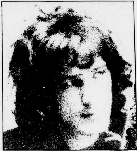
British musical comedian John Otway

Opening for Otway were The Sidewinders, an edgy Toronto rockabilly outfit who managed to capture (like no other Toronto