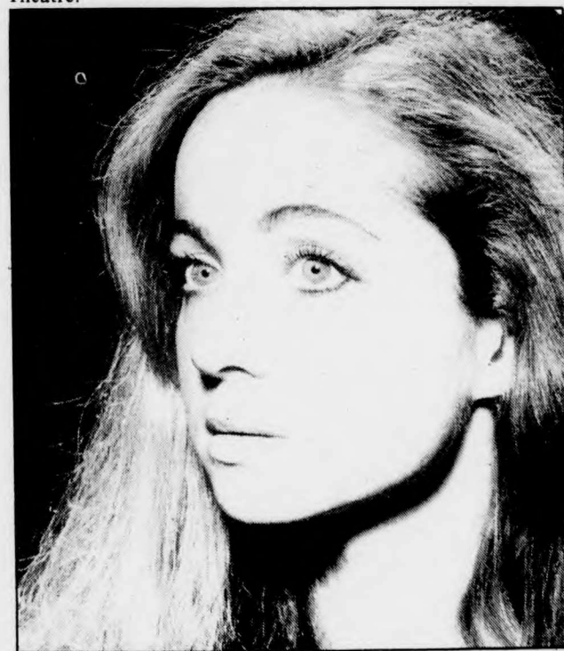
Playwright Judith Thompson