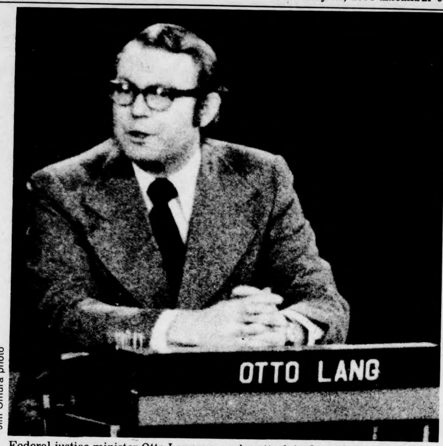
Federal justice minister Otto Lang was under attack in Osgoode last Thursday.

The tapings are scheduled to be seen in late February and early March on CHCH TV.