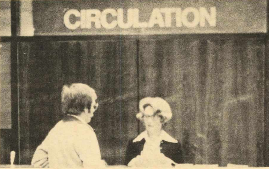
The check out policy at the library is still the same, but the fine policy has a new twist.