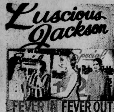
Luscious Jackson FEVER IN FEVER OUT