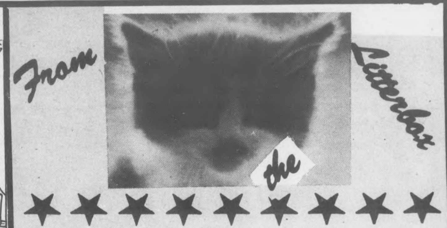
Overheard in the Bruns Office:

-What!!? You want me to be a reporter for what section? Distractions??! You can't be serious! How can I be an Intrepid Distractions Reporter?! What's to report? The Distractions section is just a bunch of cartoons, some of which may even be funny, and crossword puzzles with the wrong solutions.