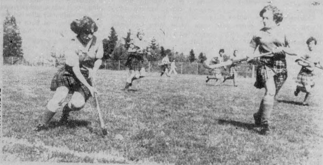
An unidentified member of the UNB Red Sticks prepares to move past an outwitted U de M opponent during Sunday's game. UNB outclassed their opponents 6-0.