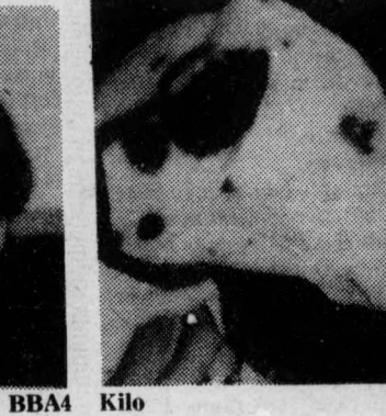
"No. I've been in the doghouse for