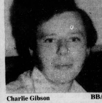
"No. I got my place about a week before the housing shortage hit. I have a landlord who is second to

none, and the place is posh. And this landlord is one person who isn't trying to rip off students."