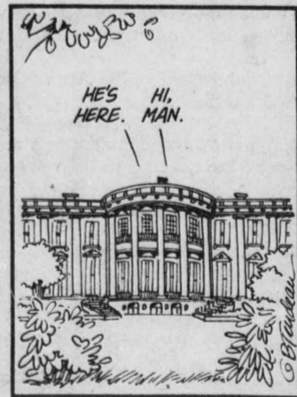
by Garry Trudeau