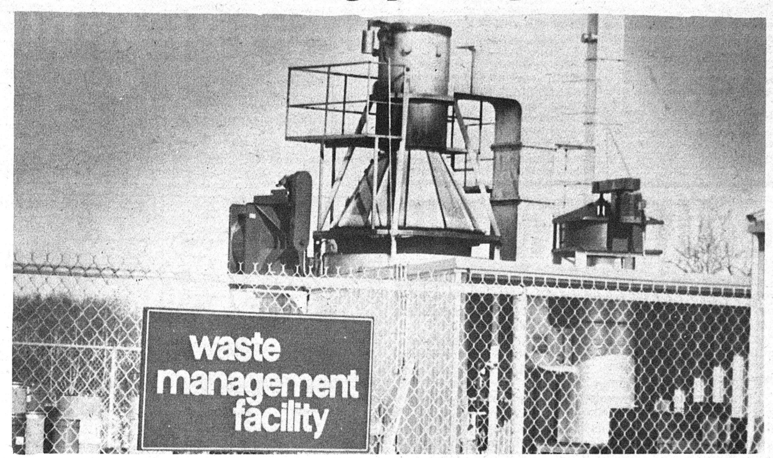
Up in smoke... The Ellerslie incinerator is nearly ready to burn the university's chemical wastes

The scrubbing water, carrythe unsavoury wastes, will be red into a lagoon, which will