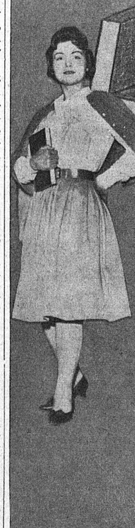
FASHION FOR FALL