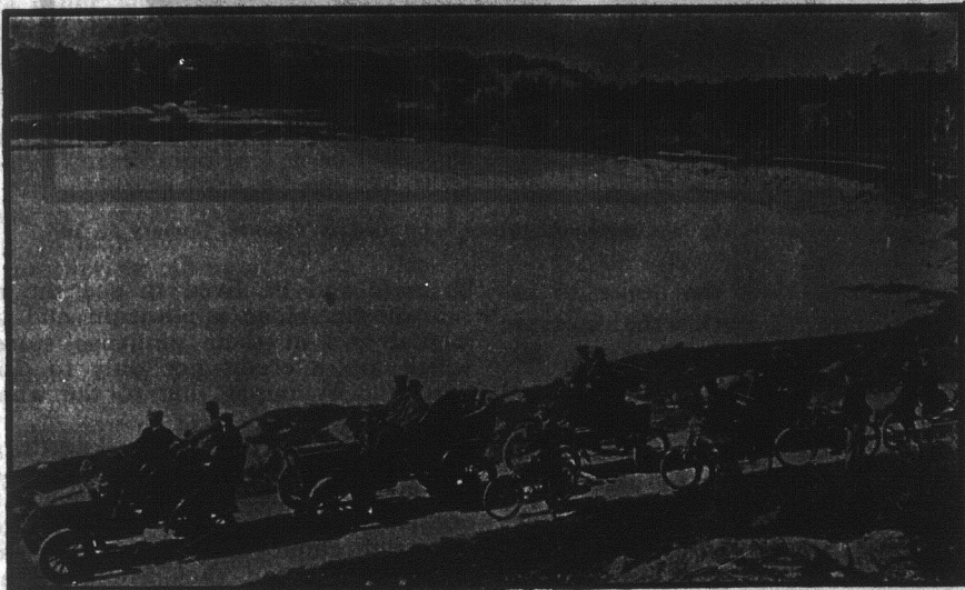
Autos at Shoal Bay, near Oak Bay, Victoria.

Grower B delivered from less than four acres of one two and three year old vines, 28,126 pounds, for which he