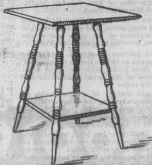
No. 691—BEDROOM or SITTING ROOM TABLE, Hardwood, Finished Antique, top 20 inches square, shelf below. This is a bargain. $7.25.

Write for our Handsomely Illustrated Catalogue.